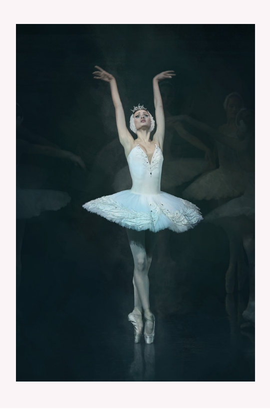
PHOTO: BALLET DE L'OPÉRA DE PERM MONTAGE / EDITING: DAMIAN SIQUEIROS / ZETAPRODUCTION.COM

The Perm Opera Ballet, renowned for its dancers' impeccable technique, is making its first appearance in Montreal with a monumental work from the classical repertoire, a pinnacle of Romantic ballet. This version of Swan Lake by Natalia Makarova, a former principal dancer of the Kirov Ballet and Royal Ballet of London, will delight ballet enthusiasts and all those wishing to discover an undisputed masterpiece, performed with the soul and lyricism of the Russian school. A red-letter day for all ballet-lovers!